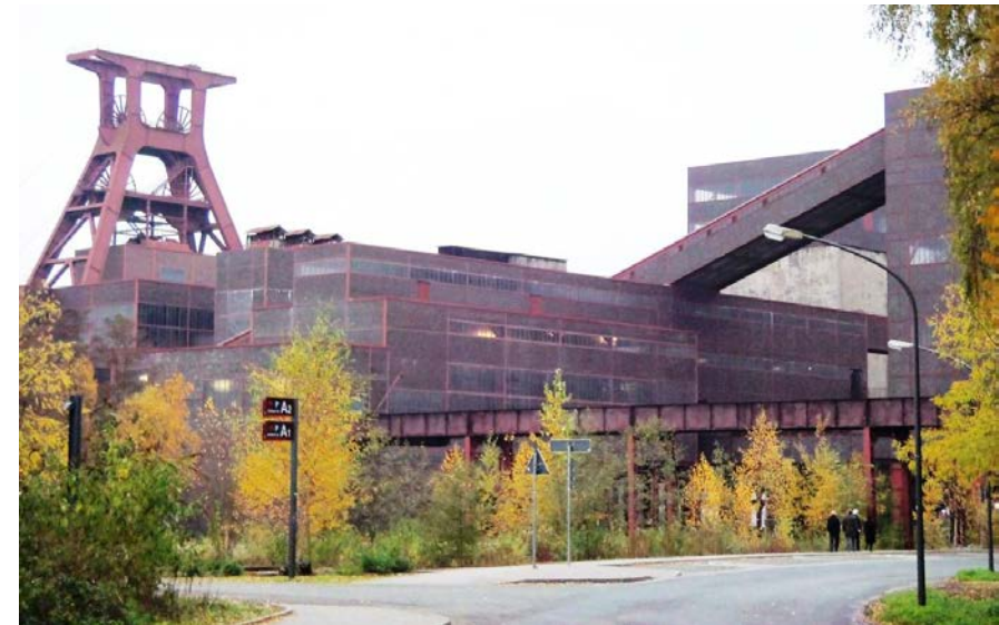
Ruhr museum of coal mining in Essen